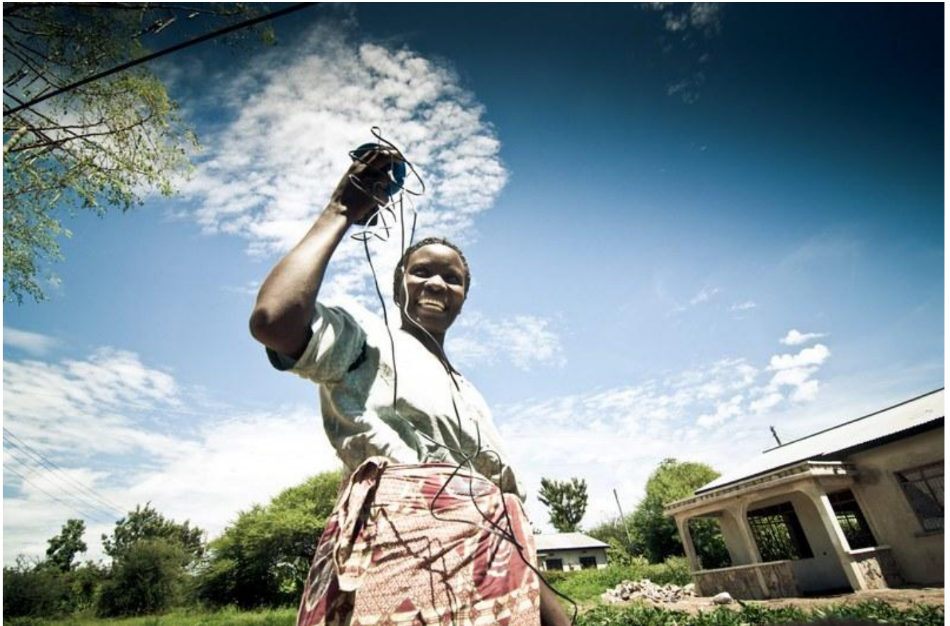
Tanzanians use mobile money platforms to pay bills

Are you working on innovative solutions designed with and for pastoralists and agro-pastoralists in drylands? If so, we would value your contribution to SPARC's innovation dashboard .