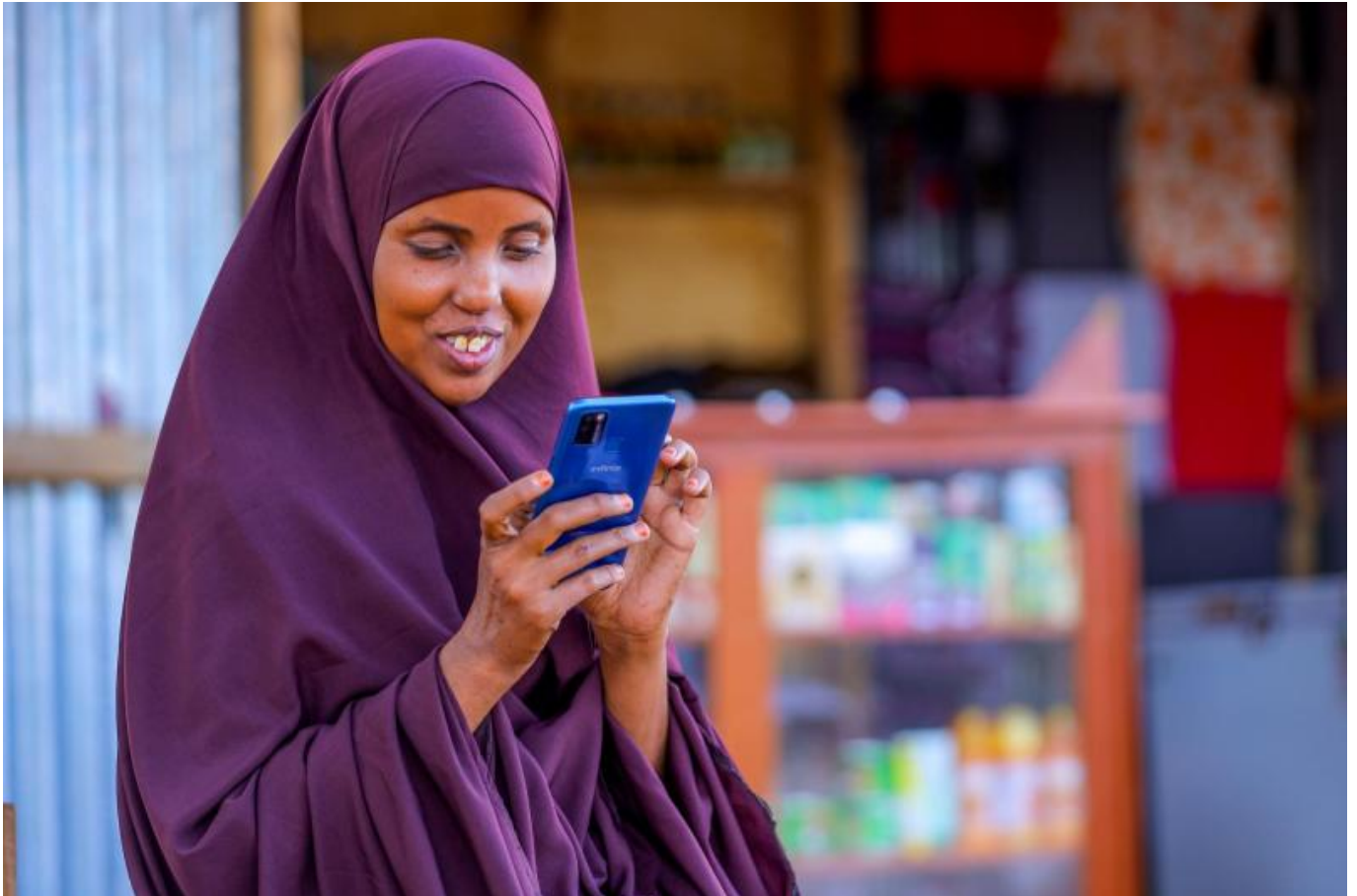
Woman with mobile phone in Kenya Credit Image by J. Mulwa/Mercy Corps

Source URL: https://www.sparc-knowledge.org/node/259