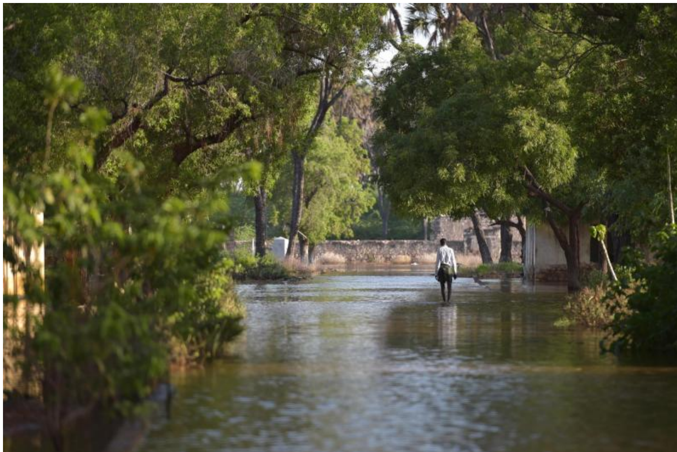
A man walks through the flood waters in Beletweyne, Somalia in May 2016.