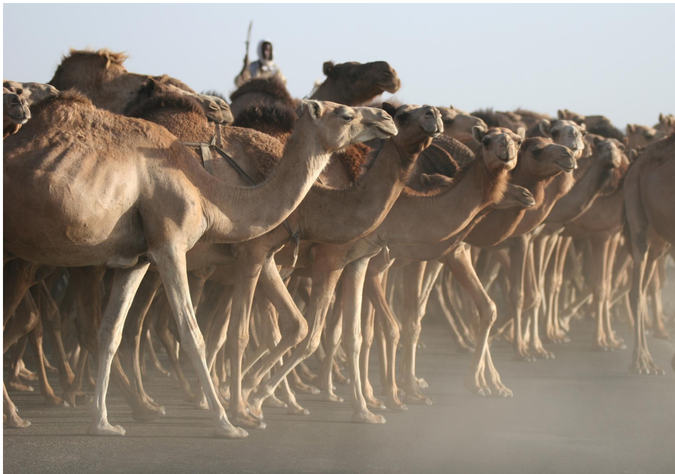
Arabian man chasing herd of camels, Sudan

https://www.sparc-knowledge.org/news-blogs/events/forum-markets-lifelines-strengthening-our-response-sudan-crisis-12-june-2025