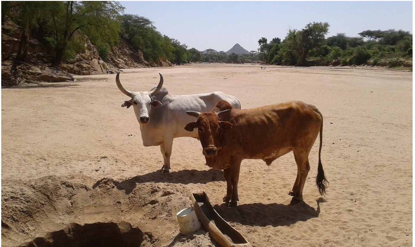
Cows in Omo Valley riverbed, Ethiopia