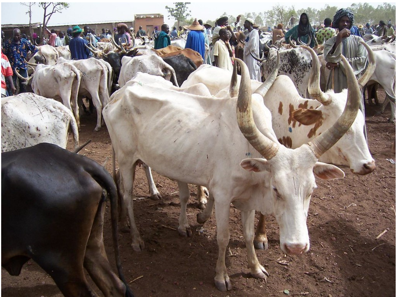
Cows in a market in Mali

Then there is the issue of trust. Scientific forecasts are sometimes seen as inaccurate, and indigenous knowledge often feels more reliable. These barriers—language, complexity, relevance, and trust—limit how effectively pastoralists can use WCIS. These barriers resonate also with literature in crop agriculture and other sectors.