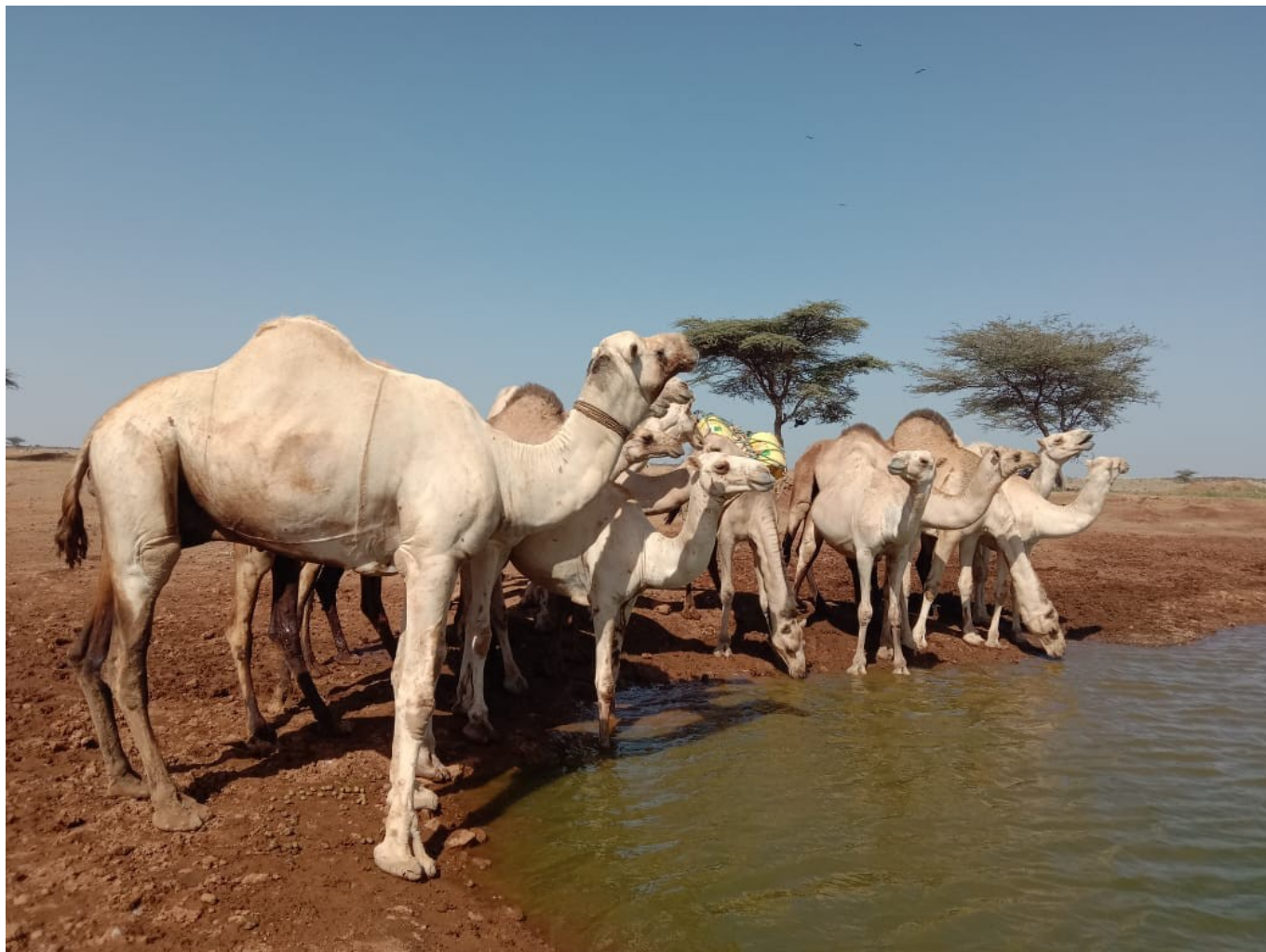
Camels at Maikona shallow wells, Chalbi Desert, Marsabit County, Kenya. The wells are a critical water source for local pastoralist communities