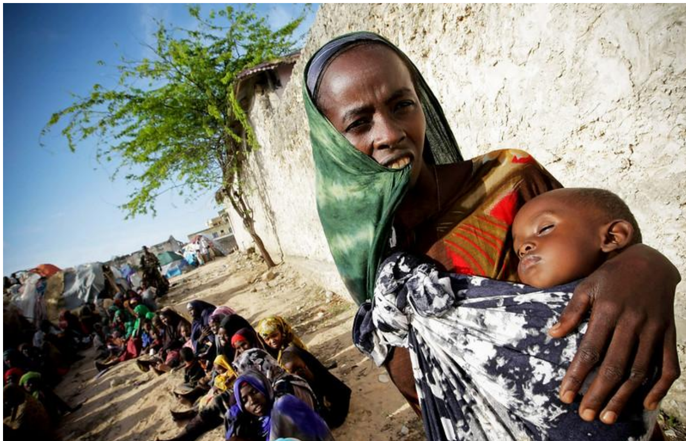
A Somali woman holds a malnourished child, waiting for medical assistance from the African Union Mission in Somalia